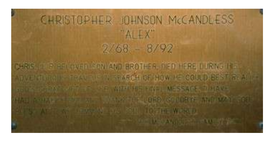
This is the plaque Walt installed on the