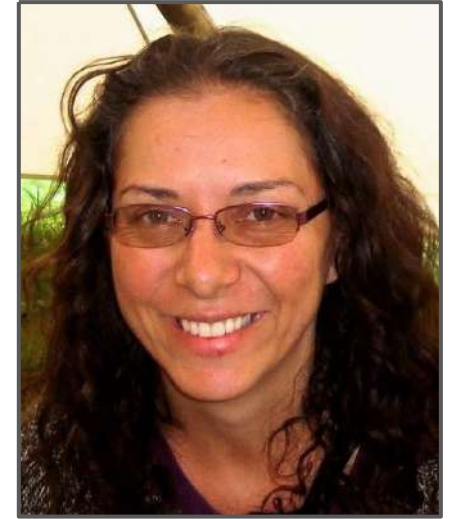
11TH & 12TH GRADE AACs