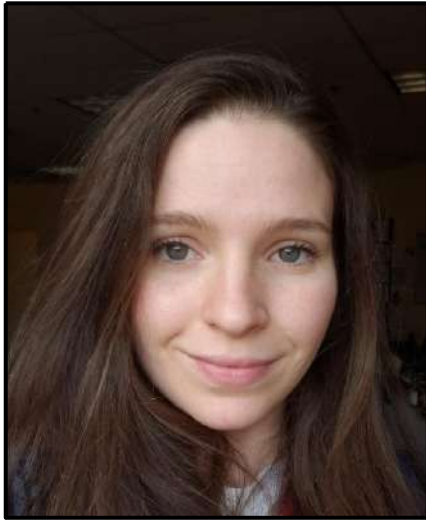
9TH GRADE AAC