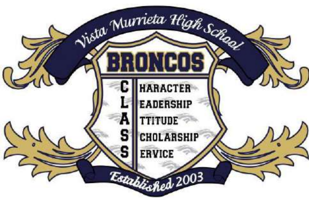
FREQUENTLY ASKED QUESTIONS