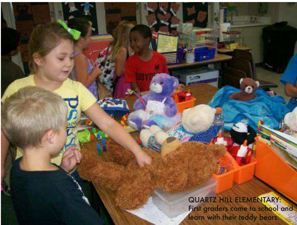
QUARTZ HILL ELEMENTARY: First graders come to school and learn with their teddy bears.