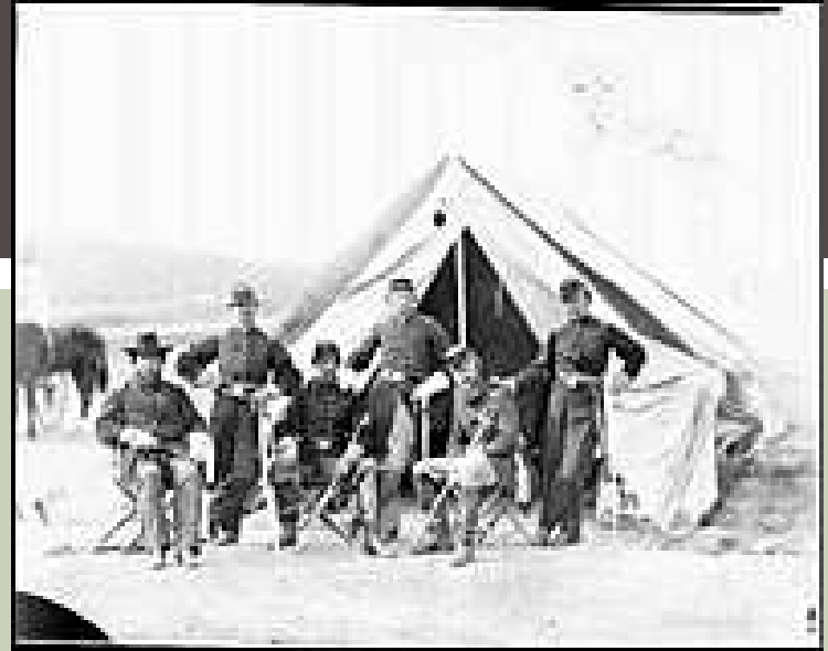
Six officers of the 17 th New York Battery – Gettysburg, PA June 1863

http://memory.loc.gov/ammem/cwphtml/tl1863.html