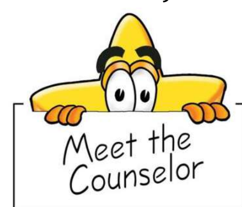
Not sure who your counselor is? See the directory below: