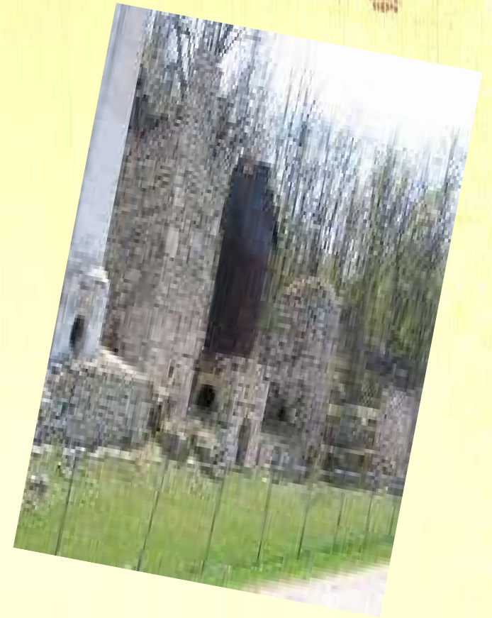
Limekiln Ruins Highcliff State Park