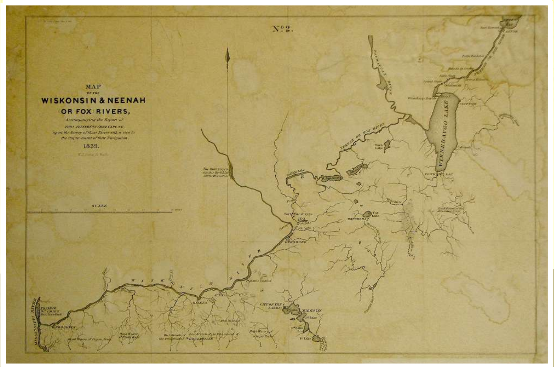
Historic Map of the “Wiskonsin & Neenah or Fox Rivers – Circa 1839