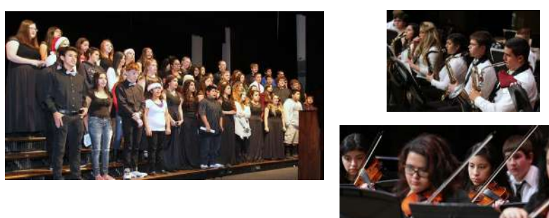
National Honor Society Induction, 2015