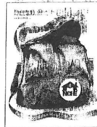
Parent Pack Pocket Folder