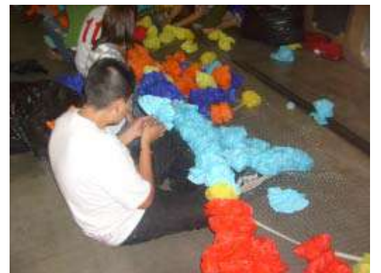
Freshmen working hard to make their float top-notch

Two weeks of flower making and construction are necessary in order to have the floats ready for homecoming night. On top of all the floats, there is royalty, putting on a great halftime show, etc. None of this could be achievable without the time and endeavors everyone puts into this as a team. So instead of wasting time find a way to wreck one another's floats, we can use that time on more important subjects like actually making the flowers and doing everything that needs to be done that way there are no last minute emergencies the day of the parade and football. It is not necessary to trash each others floats. We all at one time were or are freshmen, sophomores, juniors or seniors. Let's not take the chance of losing this unique event we have had every year. Instead, let's make the most of this occasion that no other school has the advantage to experience.