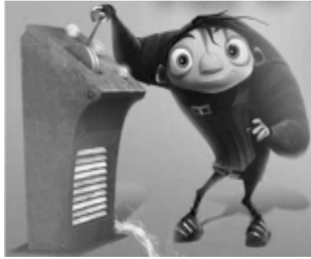
"Igor" brings out a few chuckles

entist Dr. Schadenfreude (Eddie Izzard) and girlfriend Jaelyn (Jennifer Coolidge) from stealing his idea.