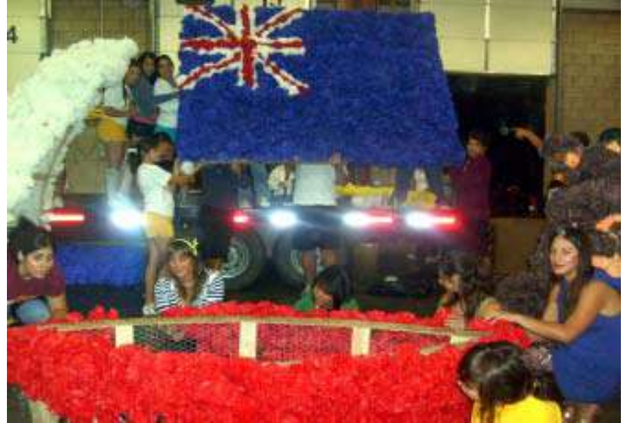
The juniors are ahead of the game with their float representing Australia. Parents, students and sponsors work together to make this a memorable homecoming.