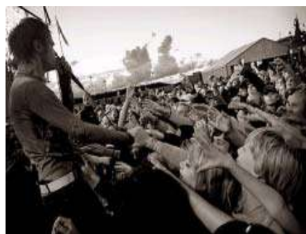
Rock out this fall

Those are a few of a concerts coming to Tucson, one hour away from your favorite bands! Go and enjoy, maybe even meet some nice people, you're bound to have something in common!