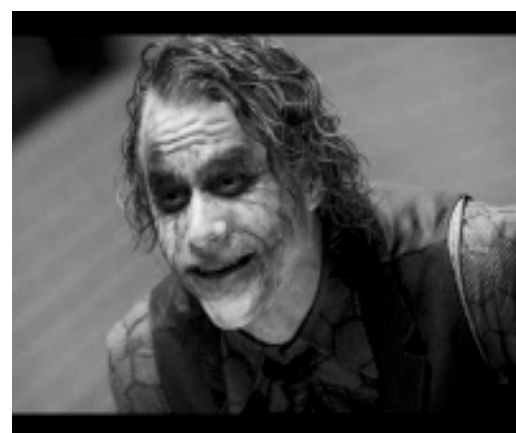
Heath Ledger wowed audiences as “The Joker”

Unfortunately, Depp has denied the validity of these rumors by saying, “It’d be a fun role to play, but I haven’t had any offers.”