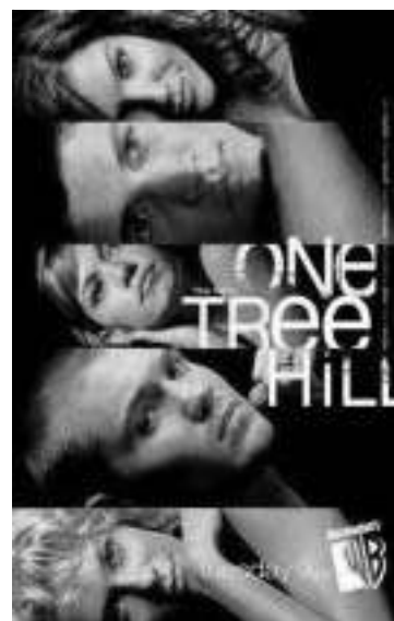
Has “One Tree Hill” gone downhill?

If I wanted more of the same drama I’d watch some Young and the Restless . If you want a good show, go rent the first season of One Tree Hill . I know I won’t waste my time watching the rest of the sixth season of the dim-witted drama fest One Tree Hill has become.