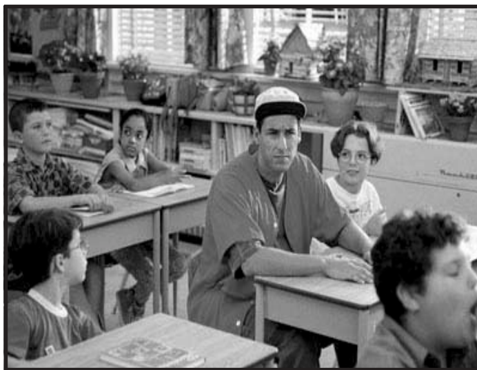
Wouldn't you like to be in second grade again?

This movie is rated PG-13 due to sexual content and language. It's not really suitable or appropriate for kids of all ages, but it is something someone must watch in their life. My overall rating of this movie would definitely have to be an A. O'doyle Rules!