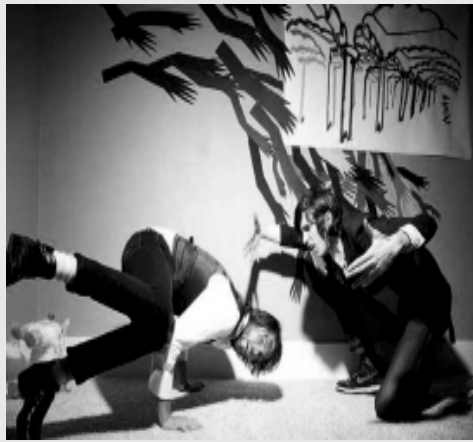
The boys from 3Oh! 3 show us their moves