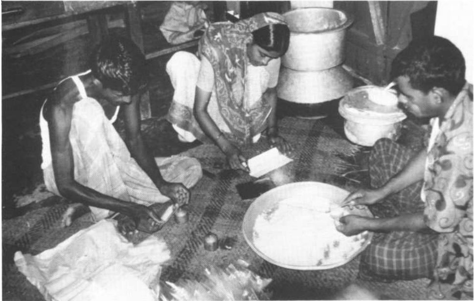
Plate 4 (a): Bengalis in Matlab mix the ingredients for oral rehydration solution and put them in small plastic packets for community distribution.