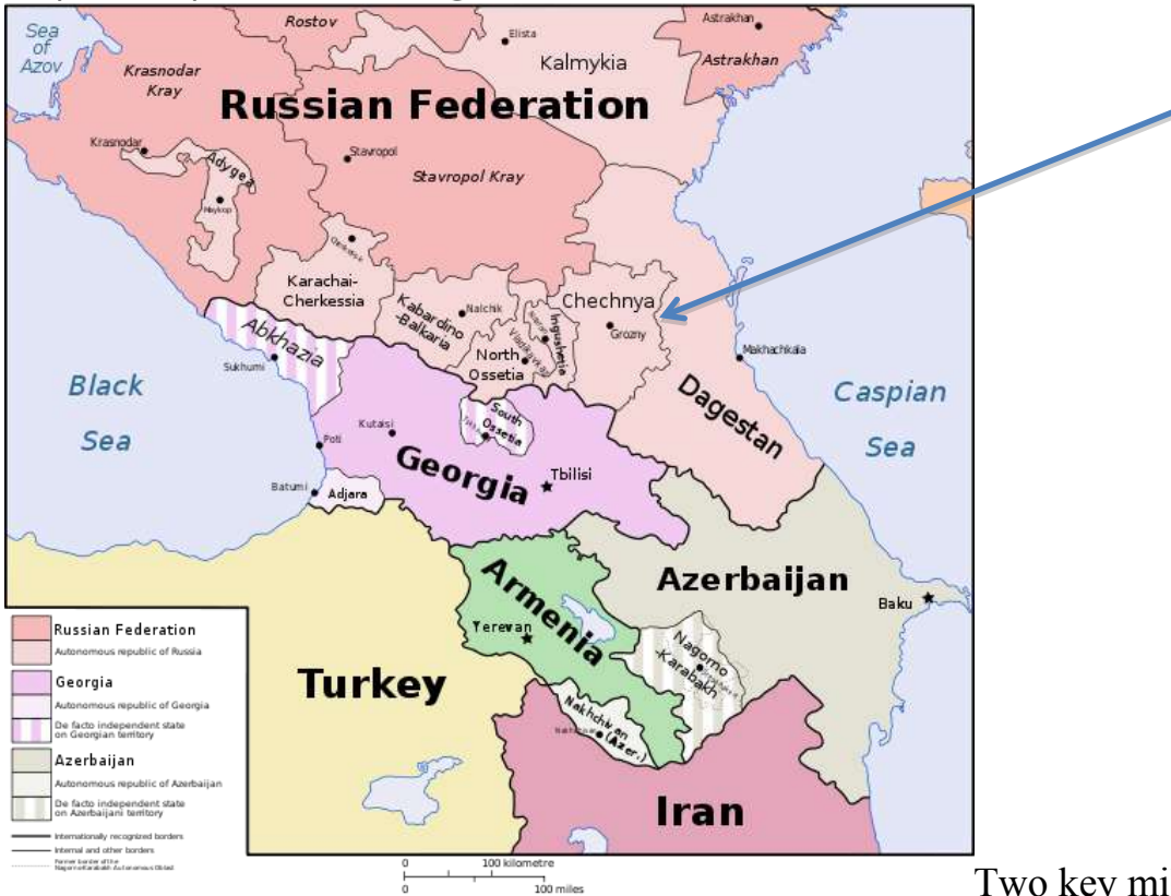
Geopolitical map of the Caucasus Region (2008)

Two key military interventions on Russia's behalf make up their rather violent history. In 1994, Russian President Boris Yeltsin sent troops into Chechnya to rid of its separatist leader, Dzhokhar Dudayev who was killed two years later after being targeted by two laser-guided missiles. The war also took the lives of many Chechen citizens as well as Russian troops. A peace agreement in 1996 brought an end to the war and gave Chechnya autonomy.