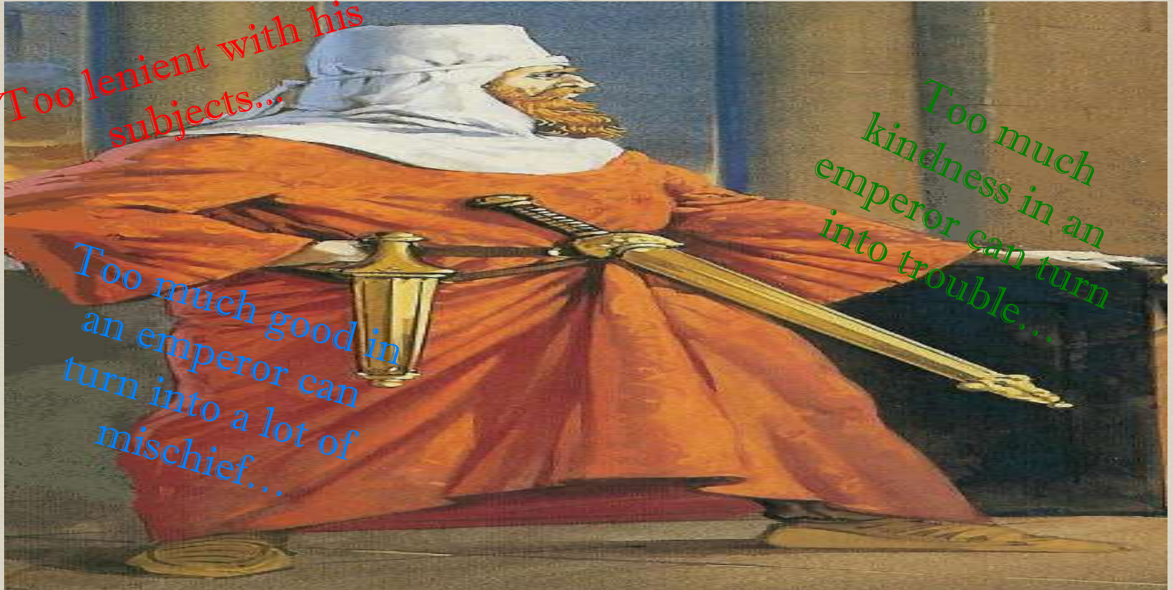
Cyrus the Great (Farrokh)