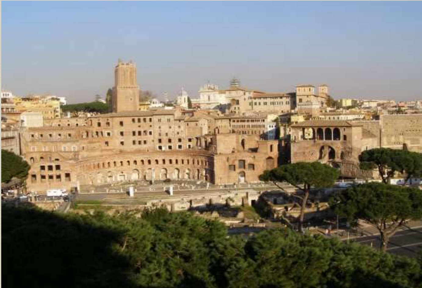
The Forum of Augustus