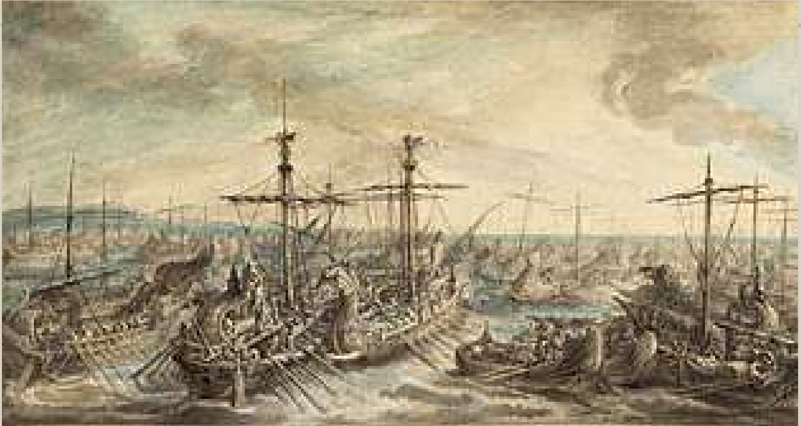
The Roman Fleet