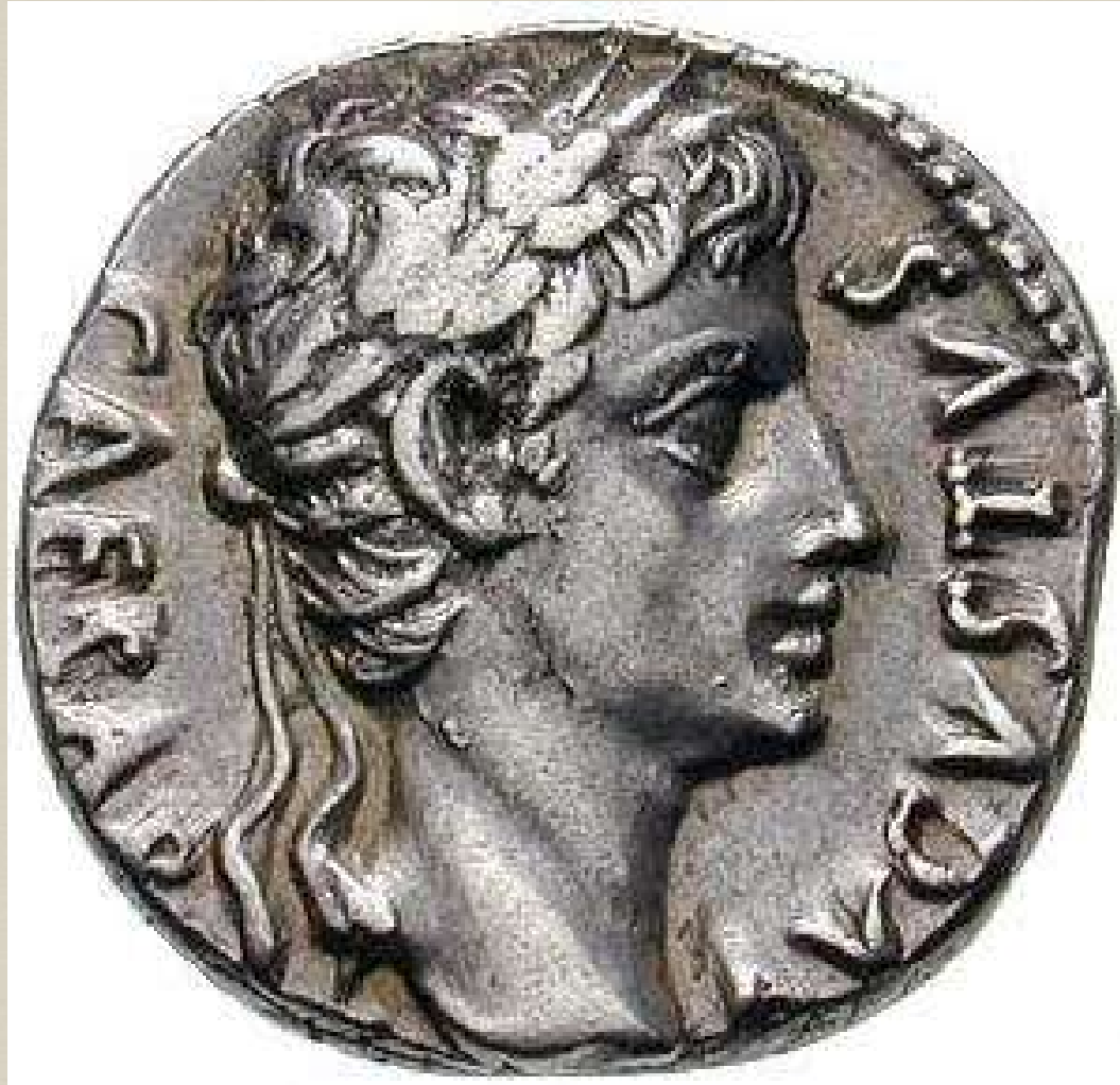
Caesar Augustus Coin