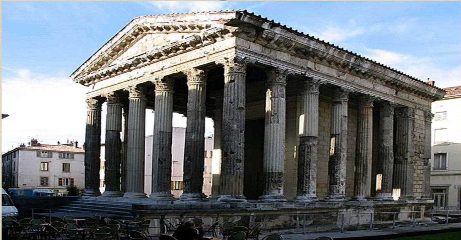
Temple of Augustus