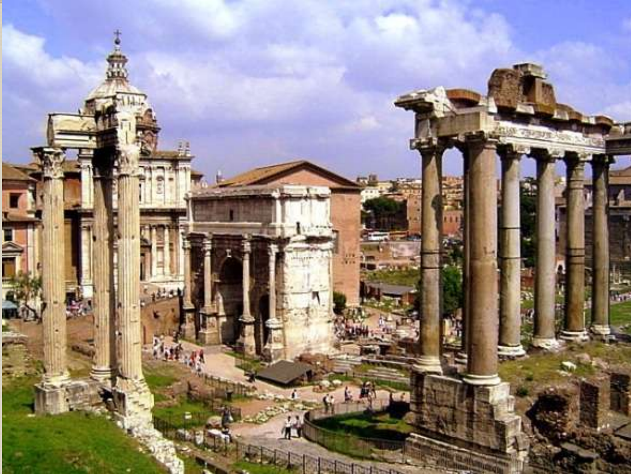
Historic Old Forum in the Eternal City of Rome