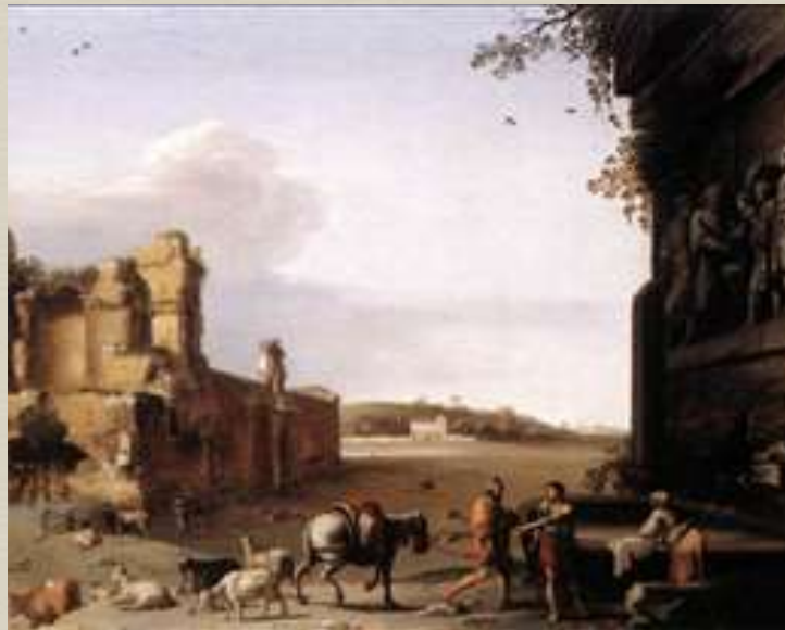
Ruin of Rome