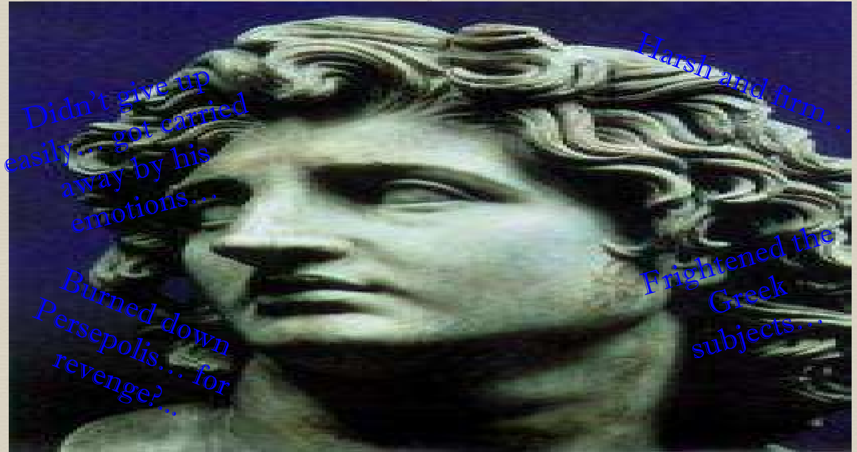
Alexander the Great