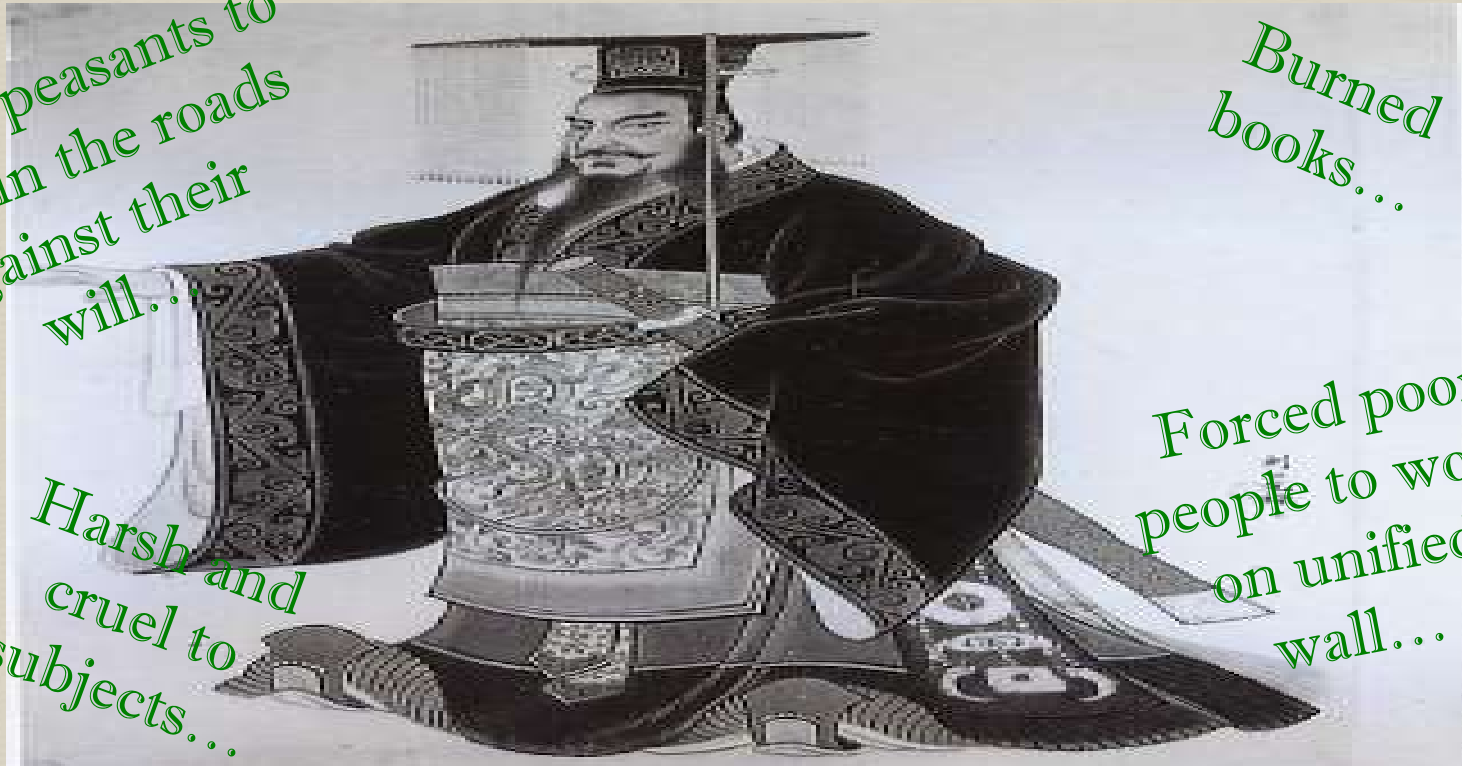
First Emperor of Qin Dynasty (First)