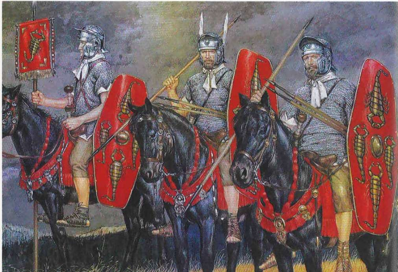
Praetorian Guard Cavalry