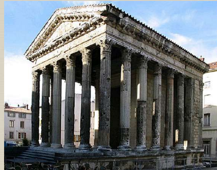
Temple of Augustus