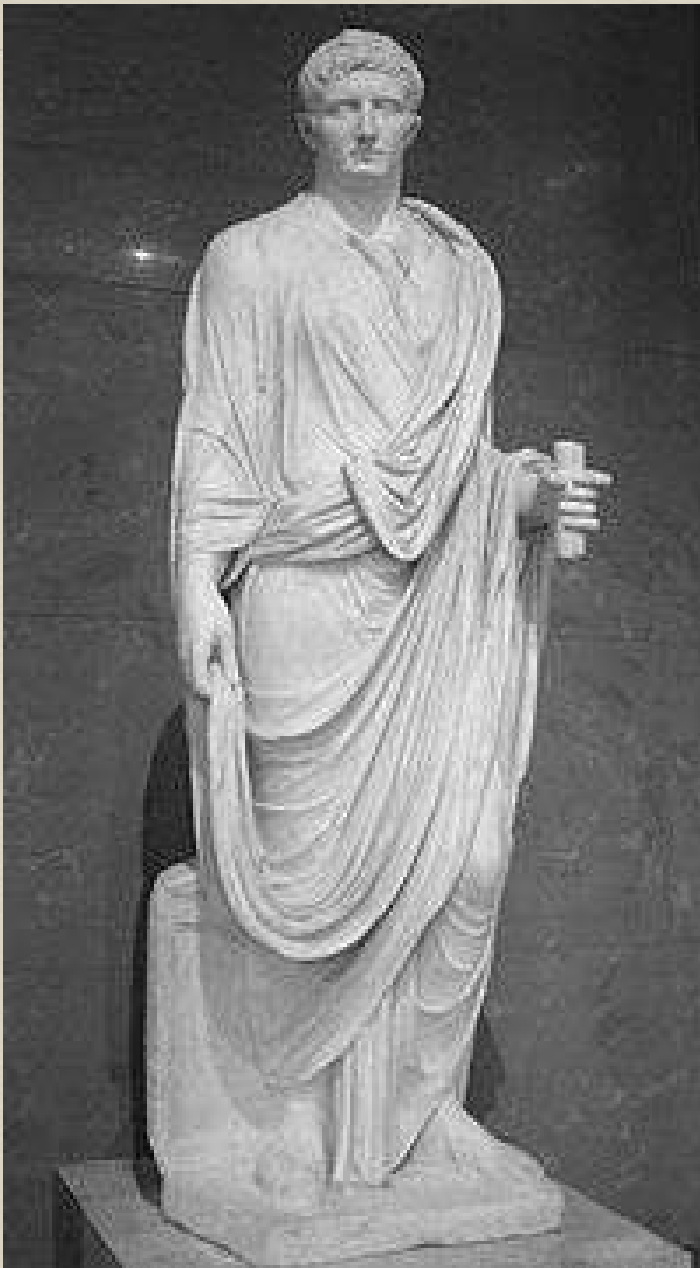
Augustus as a magistrate

“Augustus claimed that he had no more power than any other senator but that no one was to precede him in authority” (Augustus).