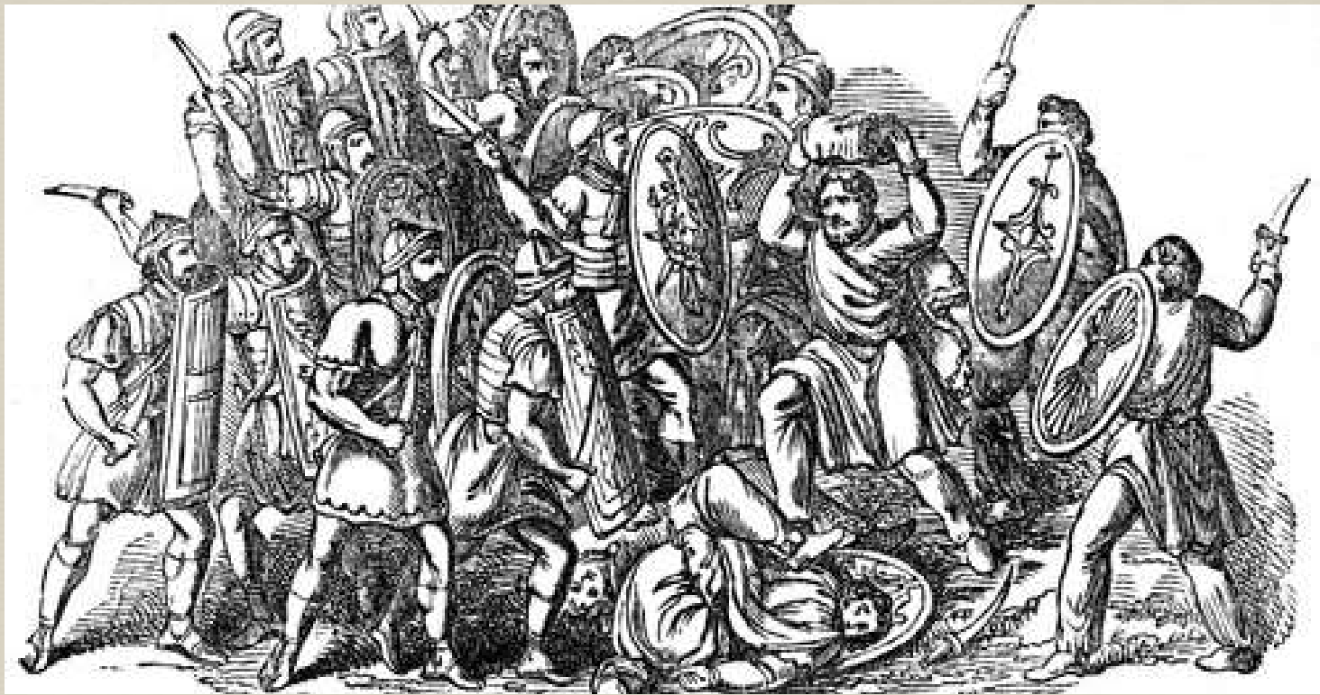
Ancient Roman Army