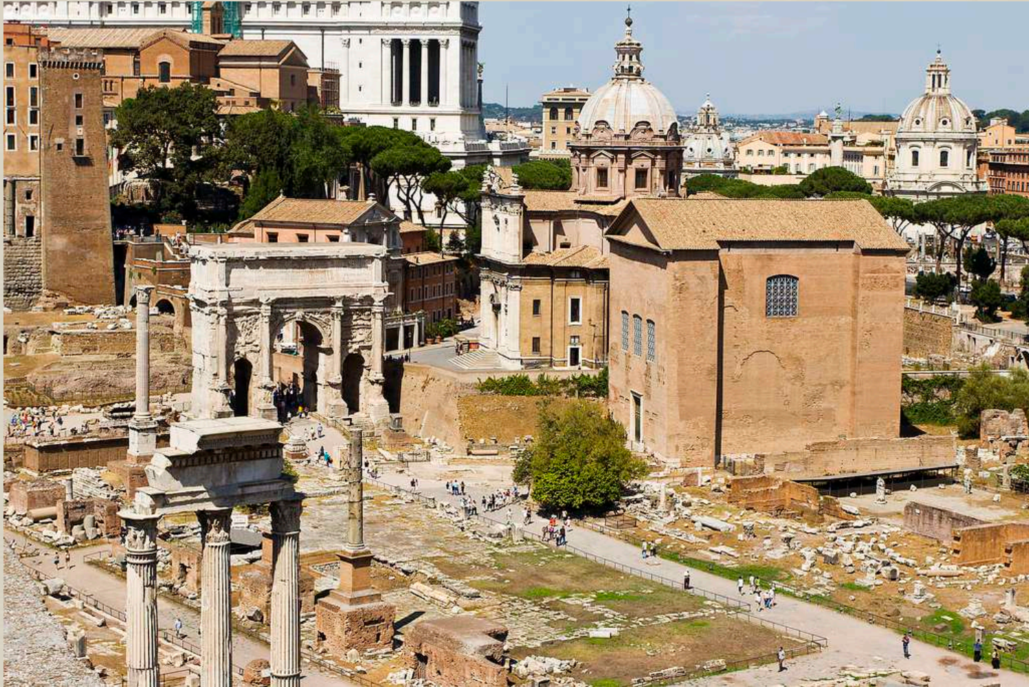
The Roman Senate House within the Forum