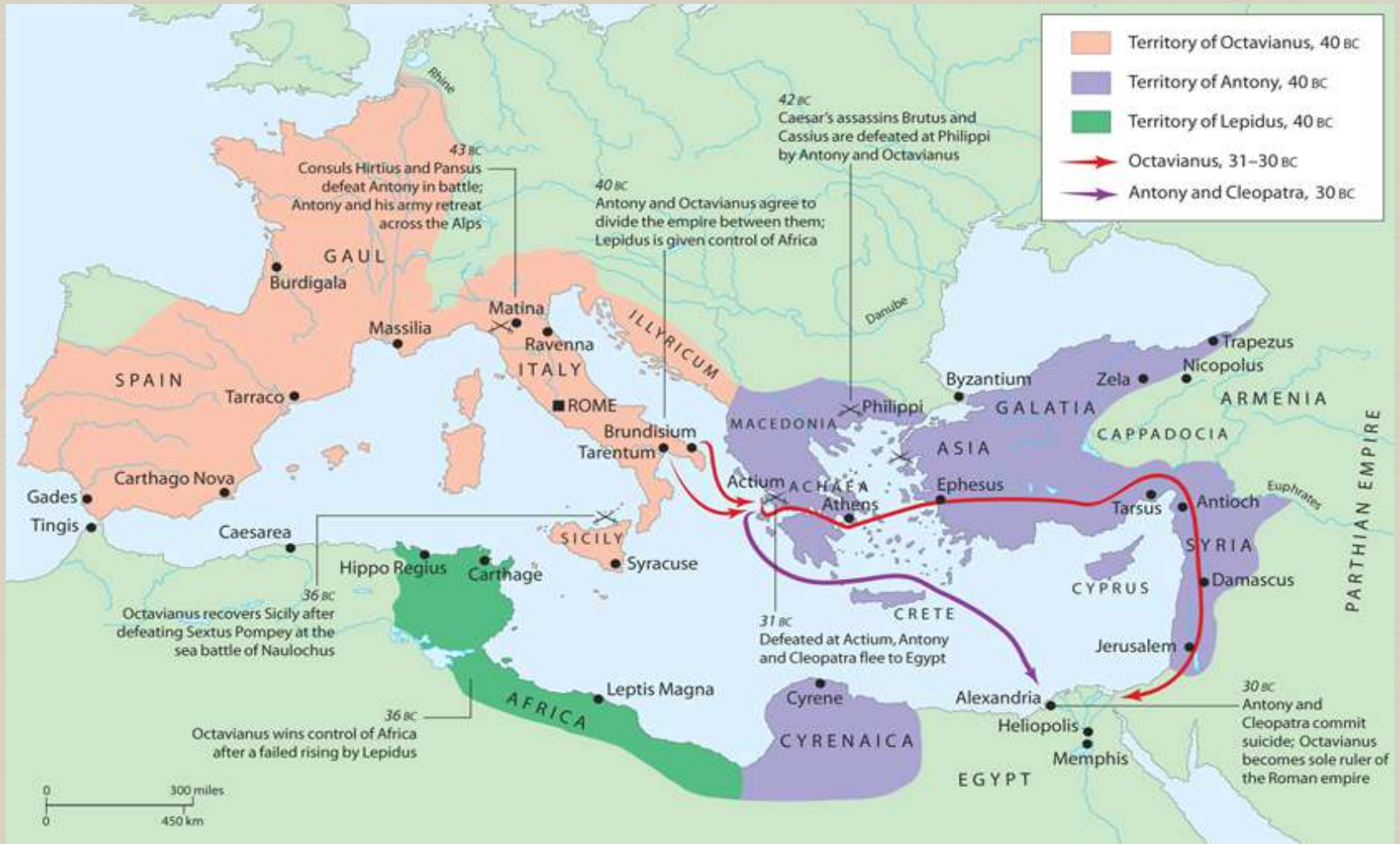
The Rise and Fall of the Triumvirate