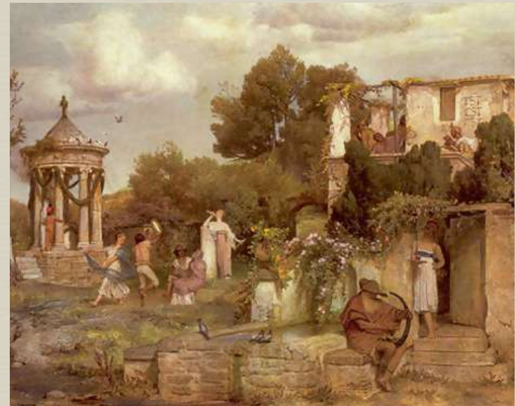
Improvements of Rome