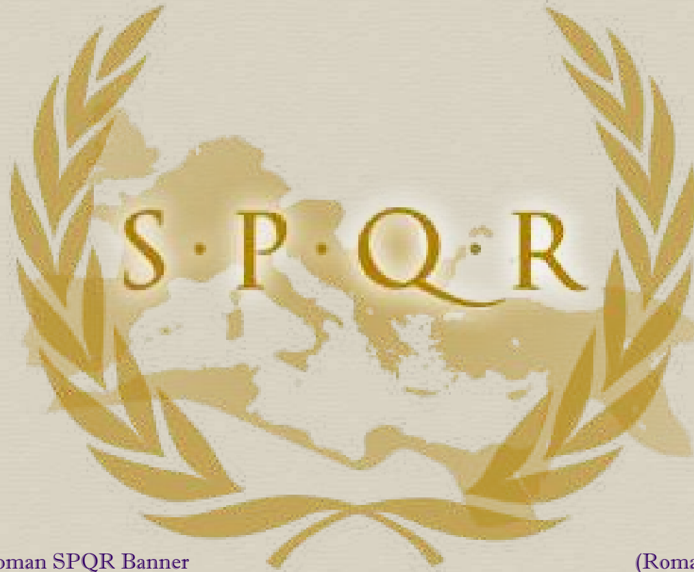
Roman SPQR Banner