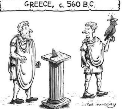
"Okay, so it tells the time — mine also sends messages"