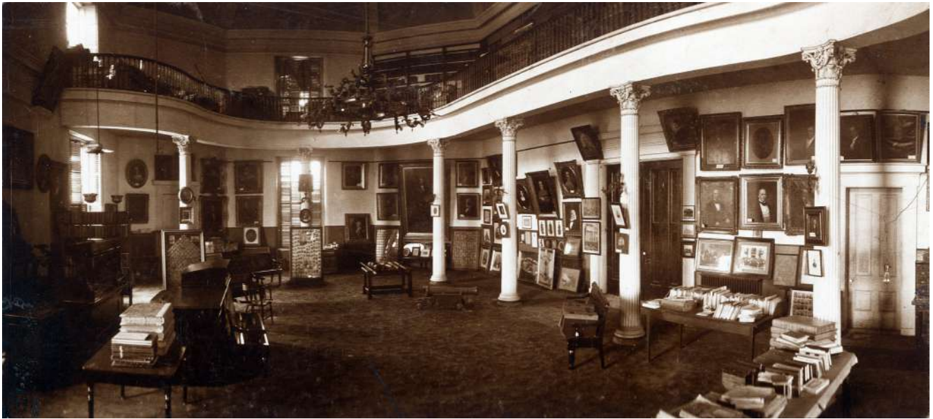
Collections of the Archives on view in the Senate chamber

and the American Historical Association both recognized Owen for his trailblazing work in the professionalization of state history and records preservation.