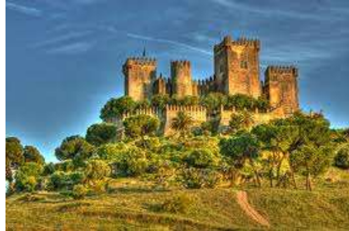
Almodovar Castle in Cordoba, Spain