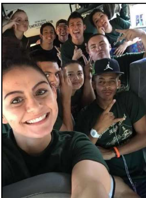
Monte Vista marching band members enjoy their trip to the Legends Festival in Parker.

The next day, October 14th, the band traveled to Colorado Springs in the hopes of qualifying for the state marching competition. The performance at regionals was critical to the success of the rest of this year’s marching season since it decided whether or not the band would be moving on to state. Ultimately, Monte Vista took first out of the 1A bands that also performed that day. Overall, they took 5th with a score of 48.45 out of a possible 100 (Cedar Ridge, who took first, scored 55.6). Since then, the Monte Vista High School marching band has been making lots of positive changes to improve the show and to make it more exciting for the audience. The band’s last adventure would be traveling to Colorado State University-Pueblo on the 26th. There, they placed fifth out of six teams, despite giving a great performance.