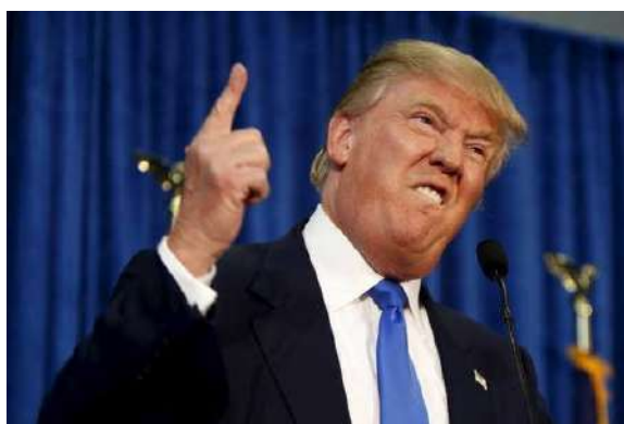
Donald Trump gestures and declares "You're fired!" at a rally in New Hampshire on June 17, 2015.

who stayed home in 2012 and whose absence at the polls resulted in a loss for Romney and a win for Obama. Limbaugh speculates that Romney's loss was primarily due to the fact that these voters could not connect with Romney's message. Yet, they do seem to be connecting to Trump's message. An ABC News/Washington Poll post on Sept. 2 showed, "Donald Trump's personal popularity has grown more polarized along racial and ethnic lines -- and yet he rose 4 points among whites since its mid-July poll in the face of withering national media criticism of some