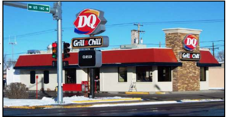
The Monte Vista Dairy Queen is a fixture on Main Street, but some former employees, current students of Monte Vista Senior High School, have expressed concerns about their experiences there.

One of the reporters tried to speak to management to get Dairy Queen's side of the story. The first time the reporter asked for an interview, they were told that management would get to them in a minute. After waiting for a while, management did not come for the interview. The second time upon entering the establishment, the same thing happened; they were not very busy, yet management still did not come to tell their side.