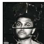
Abel Tesfaye, who records as The Weeknd, releases another piece of "sensual numbness."

of his vocals and creativity. Though most of his songs include dark and suggestive themes, I think that's what people like about The Weeknd—his unique and dark style. For the most part, this album followed that style except for "Can't Feel My Face" and "Earned It". In these two songs The Weeknd tries more of a upbeat pop style instead of his usual dark and slow style. I think that these songs were really good even though they took me by surprise when I discovered they were by The Weeknd. I think it's re-