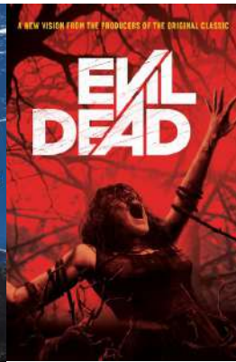
The 1981 and 2013 versions are creepily similar.