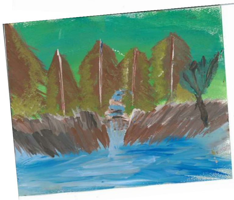
By Tayla Short