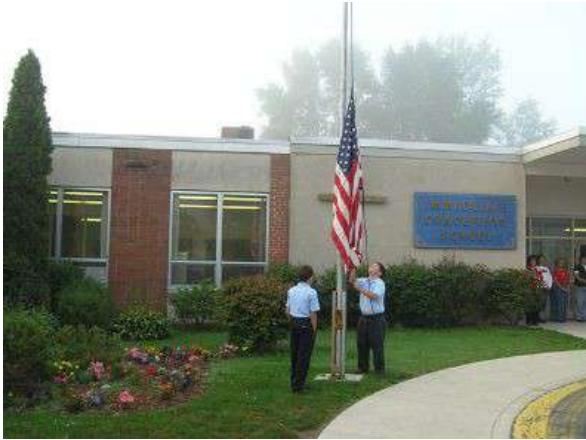
Immaculate Conception School promotes (a/an)