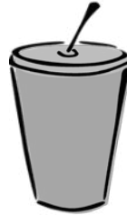
Cup B 280 mL