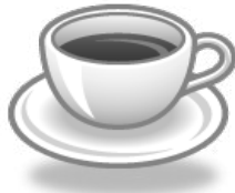
Cup A 160 mL

The capacities of three cups are shown below.