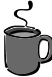
Cup C 237 mL