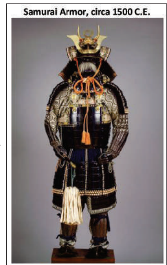
Samurai Armor, circa 1500 C.E.

Over time the power of the emperors weakened and they lost control. In the countryside laws were not followed and it became dangerous. Large landowners began to create their own private armies to protect their farms. To be safe, smaller farmers would give their land to the