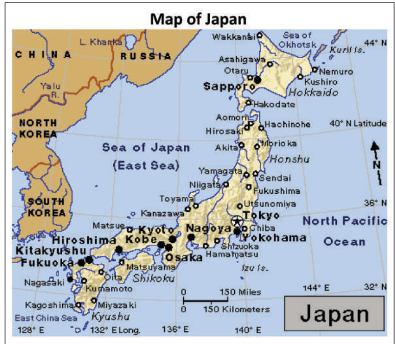
Map of Japan

Through trade and migration, cultural diffusion occurred between Japan and China as early as 100 B.C.E. Japan adopted the Chinese system of writing and a similar style of architecture. One of the major ideas that influenced Japan was Buddhism. While Shintoism was the main religion many Buddhist beliefs and rituals were accepted by the Japanese people. Both religions are still followed in Japan today.