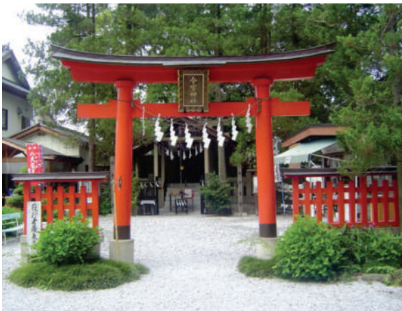
Torii at a Shinto shrine

Shintoism is an ethnic religion that is found only in Japan. Shinto was based on respect for the forces of nature and on the worship of ancestors and the emperor. Worshipers believe in kami , which are spirits found in nature. All parts of nature such as trees, rocks, waterfalls, and mountains, could be the home of a kami. Many shrines are built near a natural feature or the location of a historical event. Most of these shrines have a torii, or Japanese gate, at the entrance to separate the everyday world and the sacred world.