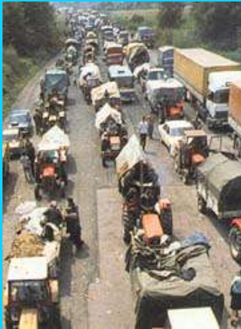
Serbs expelled from Croatia 1995