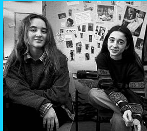
Muslim and Serb refugees From Sarajevo

Intermarried, cooperated, 1950s-80s; At war 1990s