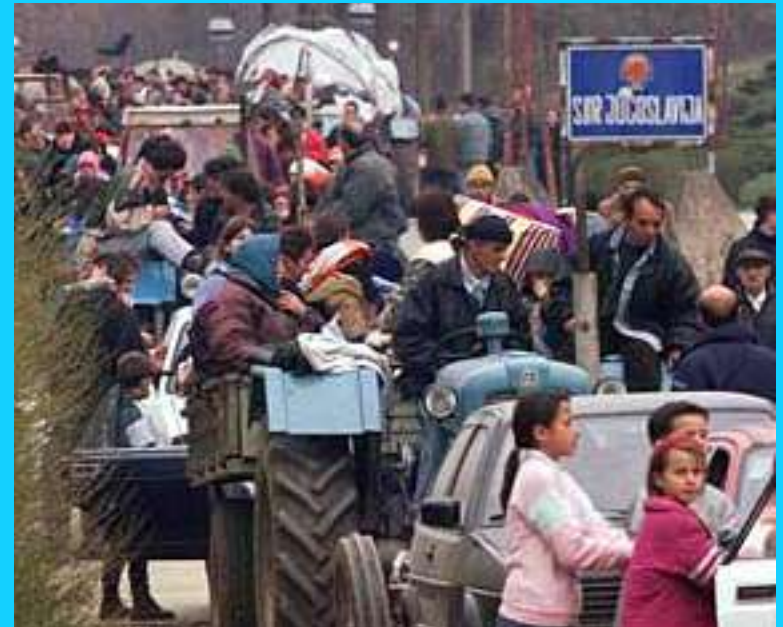
Albanians expelled from Kosovo (Serbia), 1999