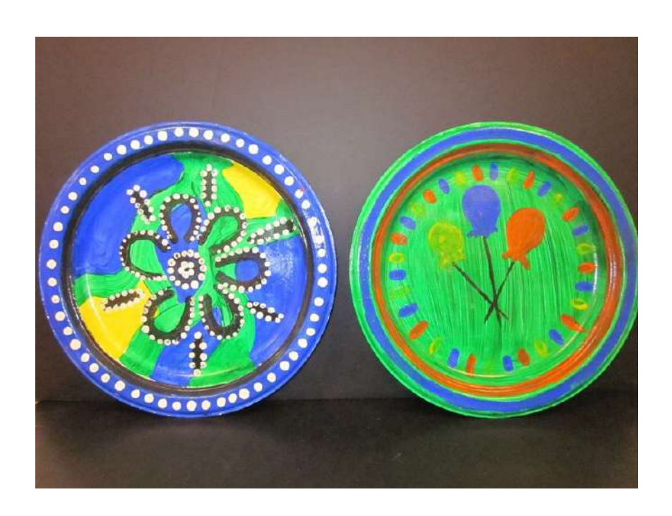
Garza Celebration Plate Project DM