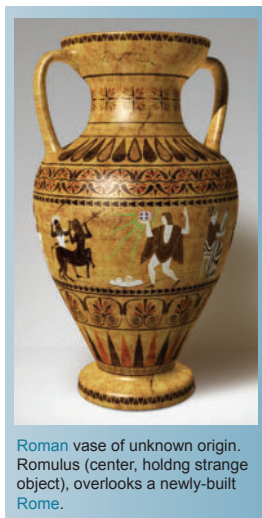
Roman vase of unknown origin. Romulus (center, holding strange object), overlooks a newly-built Rome.

In 755 BCE, there was still no city. But the brothers had had enough of the stalemate. They tentatively agreed to be friends again, and to let the Gods choose between their two hills. A plan was hatched. For the first time in their lives they separated, and Romulus went and stood on Palatine Hill and Remus went and stood on Aventine Hill. Each waited for a sign from the Gods. For a little while nothing happened—and then, suddenly, six birds swooped before Remus, cawing and shrieking. Remus was thrilled. His hill had clearly been chosen! He ran to tell Romulus, but Romulus was running towards him. He had seen birds too—twelve of them. Romulus felt he was obviously the chosen one, and shaved off his beard as a symbol of his victory. Remus pointed out that he had seen his birds first, but Romulus ignored him. He summoned some men to start building a trench. Remus was so mad that he refused to go near Romulus for an entire year. By the end of the year, the city was almost ready to be built.