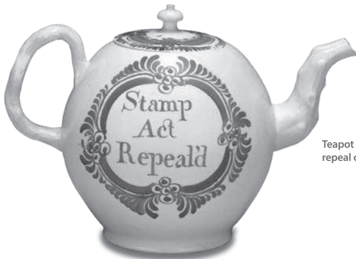
Teapot celebrating the repeal of the Stamp Act

Tea was a popular drink in the colonies, just as it was in Great Britain. However, many people decided they would not buy British tea if they had to pay an unfair tax. And they thought the new tax on tea was every bit as unfair as the old tax on paper. After all, the new tax had been approved by the same British Parliament in London, and there were still no representatives from the 13 colonies there.