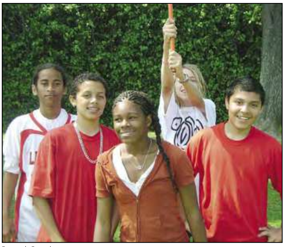
Fun with Friends

On Friday, March 20, 2009 many Collins 6-8<sup>th</sup> grade students participated in an outdoor celebration. What were we celebrating? Growth, progress, hard work and success! Every student who passed the Quarter Three Math Benchmark and/or the Quarter 2 Language Arts Benchmark was invited to attend the celebration. Students who scored intensive (well below grade level) on previous benchmarks but who worked hard and showed improve-