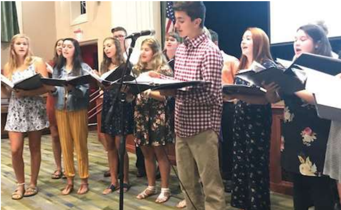
GHS CHAMBER CHOIR PERFORMING AT CONVOCATION

January 13 January 21 - Tuesday January 27 February 3 February 10 February 24 March 9 March 23 April 13 April 27 May 11 May 26 - Tuesday June 8 June 22