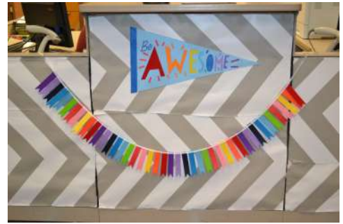
Schools provided a warm, welcoming environment for returning students.