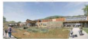
NEW ELEMENTARY SCHOOL AT THE HUCKLEBERRY HILL SCHOOL SITE 100 CANDLEWOOD LAKE RD BROOKFIELD, CT

http://newschoolproject.brookfieldps.org/