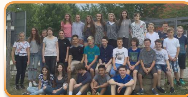
Group photo of the exchange students at Franziskus Gymnasium in Mutlangen, Germany

for the Euro-Cup and spectacular performances during a medieval festival called the 'Stauffen Saga'. We were lucky to have great weather and no security issues. The students had a great time and were very responsible throughout the trip. We are hoping to host three of the German exchange students for a long-term stay from January to June 2017 at Sheehan. For May 2017 we are looking for 20 Moran and Sheehan families to host students from Franziskus Gymnasium in Mutlangen, Germany. This exchange is currently being planned.