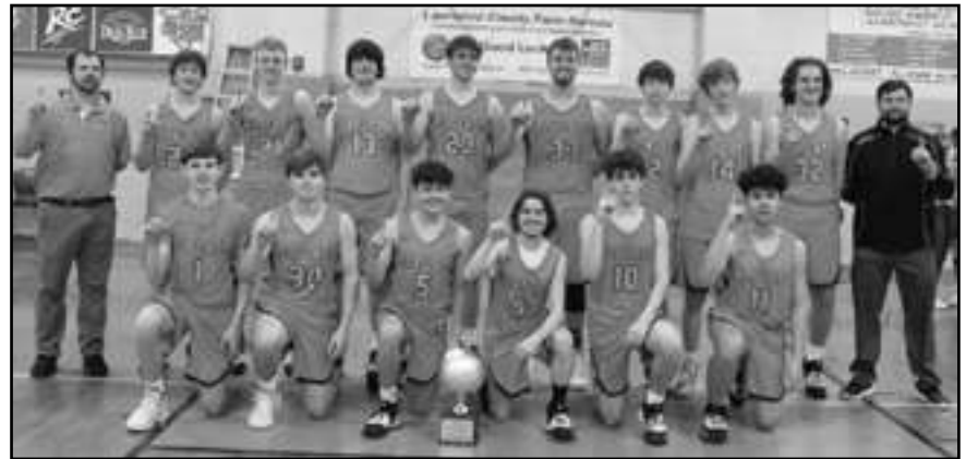
LawCo Tournament marked the final basketball games in Sharum Gym.

The Walnut Ridge Lady Bobcats placed second in the tournament, losing to the top-seeded Hoxie Lady Mustangs 56-63. In the first round of the tournament, the Lady Bobcats beat Sloan-Hendrix Lady Greyhounds 71-47. WRHS hosted the games this year.