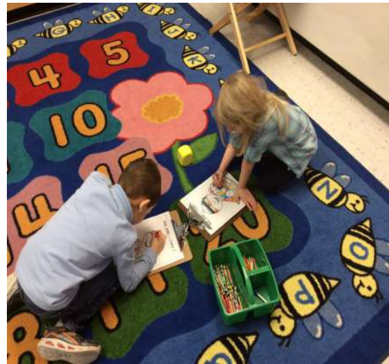
Kindergarten Students from Mrs. Lemieux' class working cooperatively on a math activity!