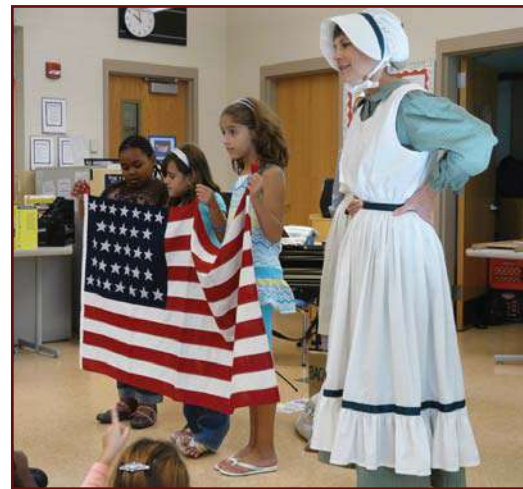
Students learn the story of the Oregon Trail.

The day-long program featured interpretive dance, narrative storytelling, musicians, artists, and dancers for students and the community to participate and enjoy.