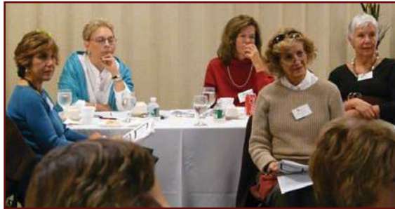
Fairfield County retired educators attend the Kick-off Buffet Luncheon Celebration.

This fall C.E.S. has launched a new program for Fairfield County's retired educators, called RE-C.E.S. (Retired Educators at C.E.S.). The program's ongoing goal is to engage, support and involve retired educators in their continuing interest in education. RE-C.E.S. aims to provide personal interest, mentoring and volunteer opportunities to the retired educational community.