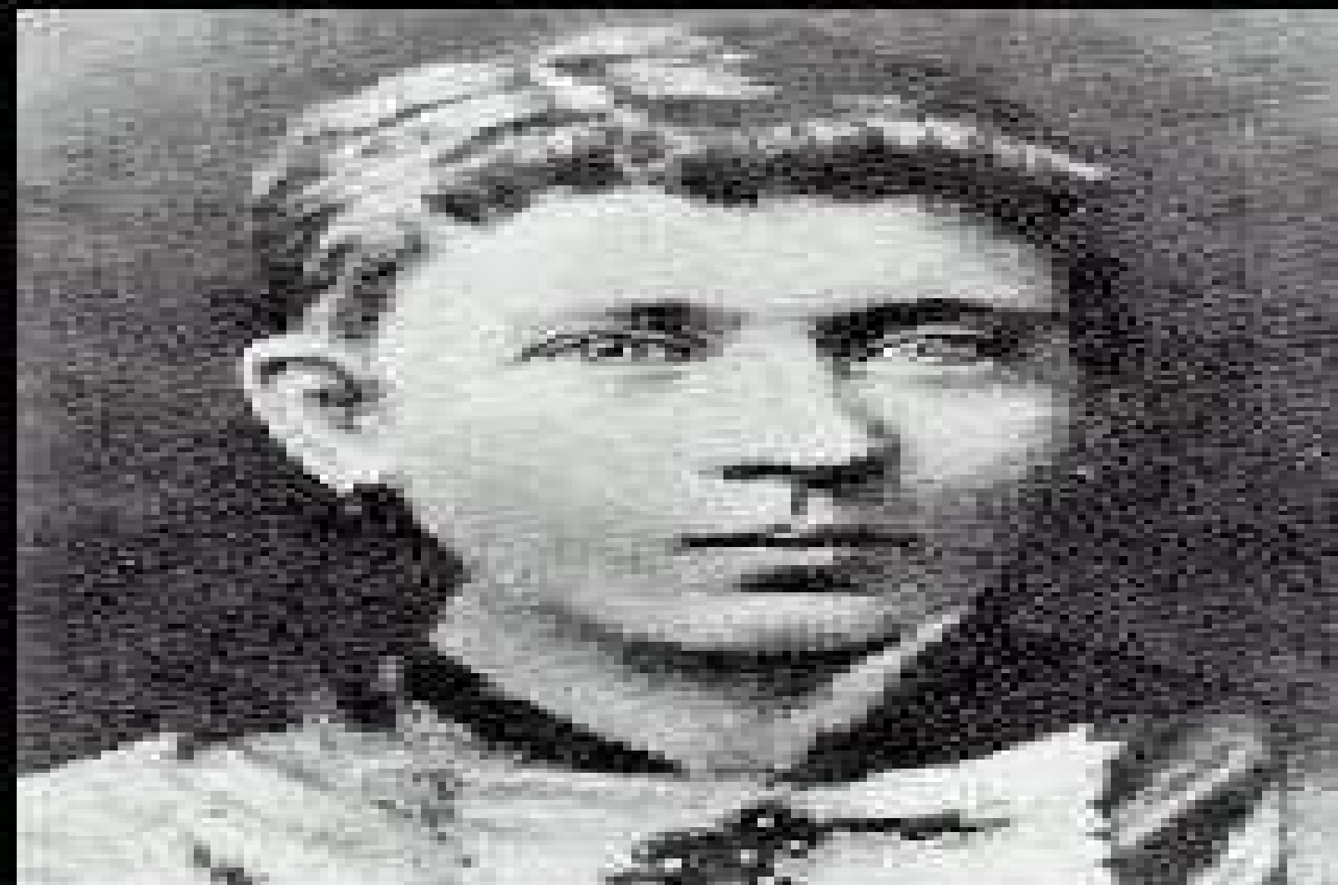
Hitler's mother, Klara