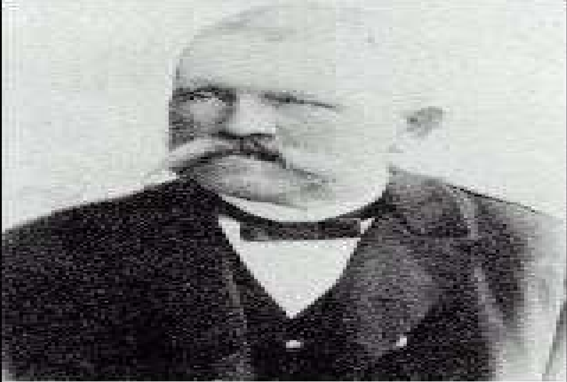
Hitler's father, Alois