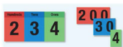
(Above) Place Value Chart, to the millions place