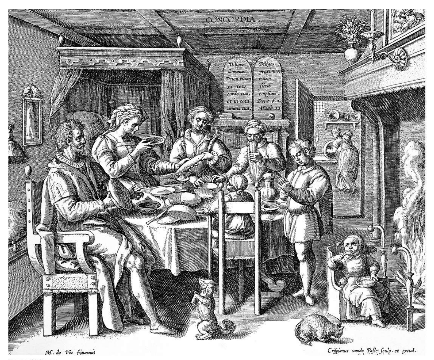
Domestic Scene Chapter 14, A History of Western Society, Tenth Edition Copyright © 2011 by Bedford/St. Martin's Page 413