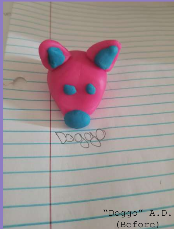
"Doggo" A.D. (Before)