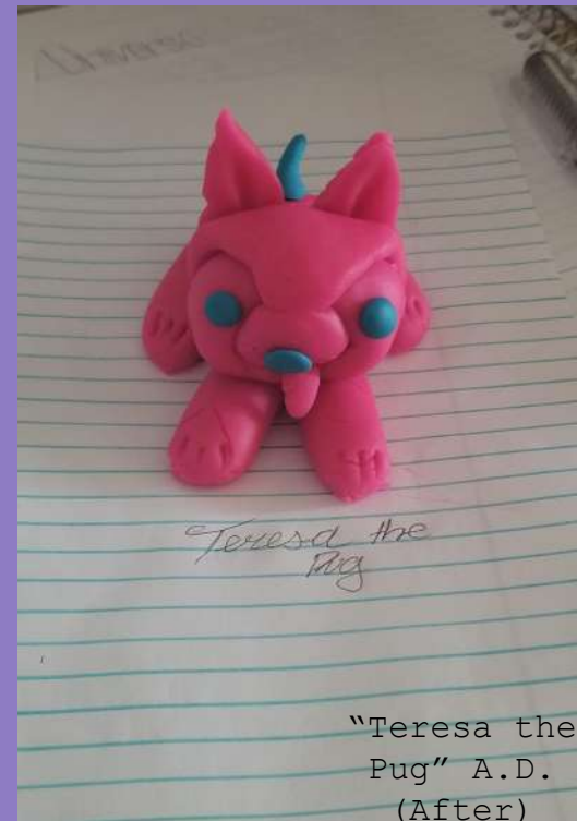
"Teresa the Pug" A.D. (After)