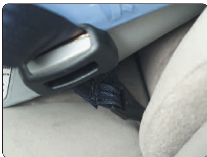
Flexible LATCH hook using anchor bar