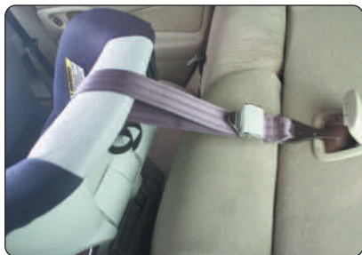
An anchor option for tether hook