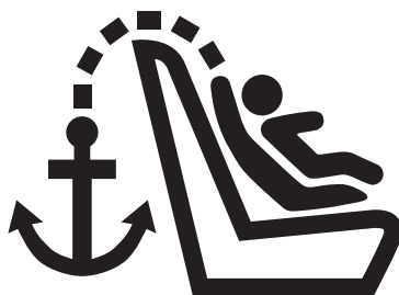
Tether anchor logo

LATCH provides an alternative option for child seat installation to bypass the safety belt system. All vehicles since 2002 have the LATCH system that uses child restraint lower anchors and top tether anchors. At least two rear-seating positions in each vehicle are equipped with the system. In addition, a third rear-seating position has an upper tether anchorage to hold the child seat tightly. The child restraint anchorage system are standardized and independent of the vehicle seat belts.