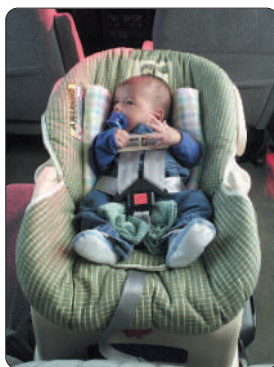
Spaces filled with cloths