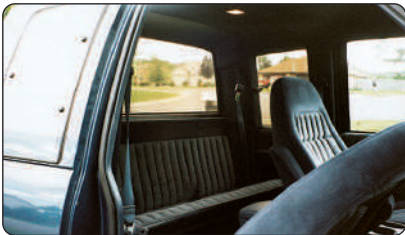
A rear bench seat of a pickup truck.