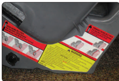
A warning label on a child restraint.