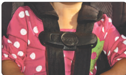
Plastic harness retainer clip should be at child's armpit level.