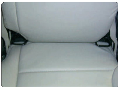
Lower anchor bars