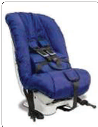
Hippo car seat for hip spica cast