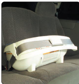
Angel Ride car bed