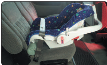
Rolled towel for angle when using seat without the base.