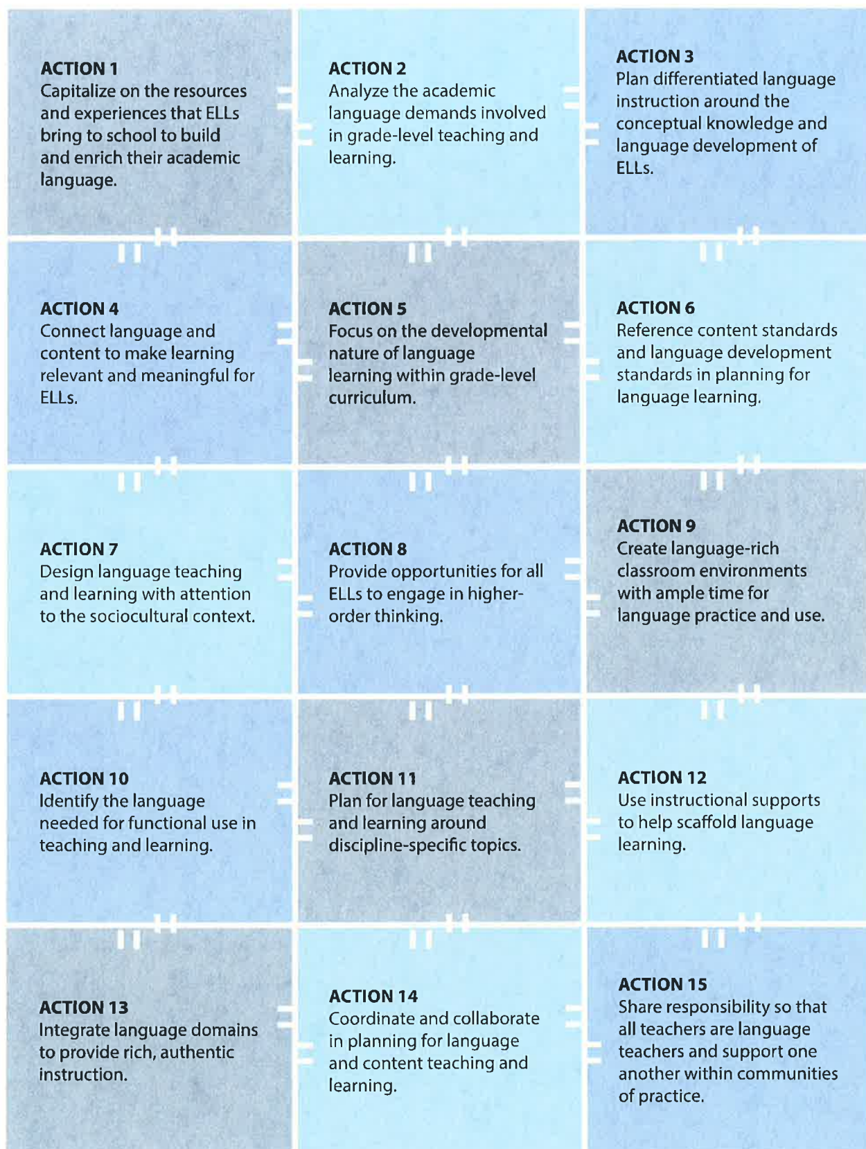
Figure E: Essential Actions for Academic Language Success