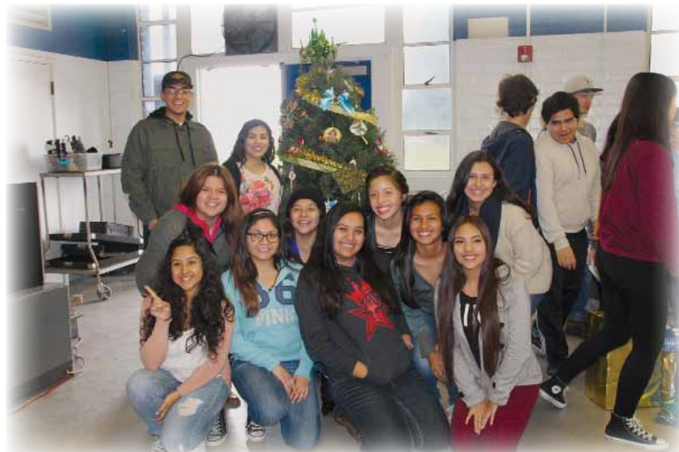
Senior ASB members decorating a tree during the class tree decorating competition.