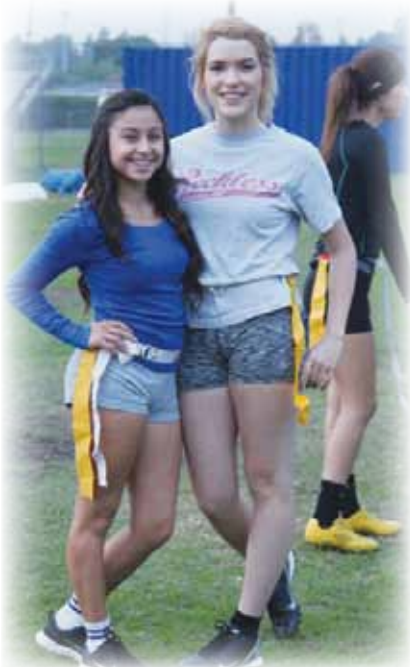
Seniors during Powderpuff practice.