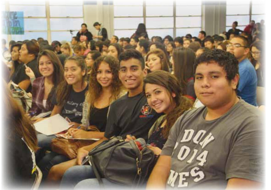
Seniors attending the first student Town Hall meeting after school.