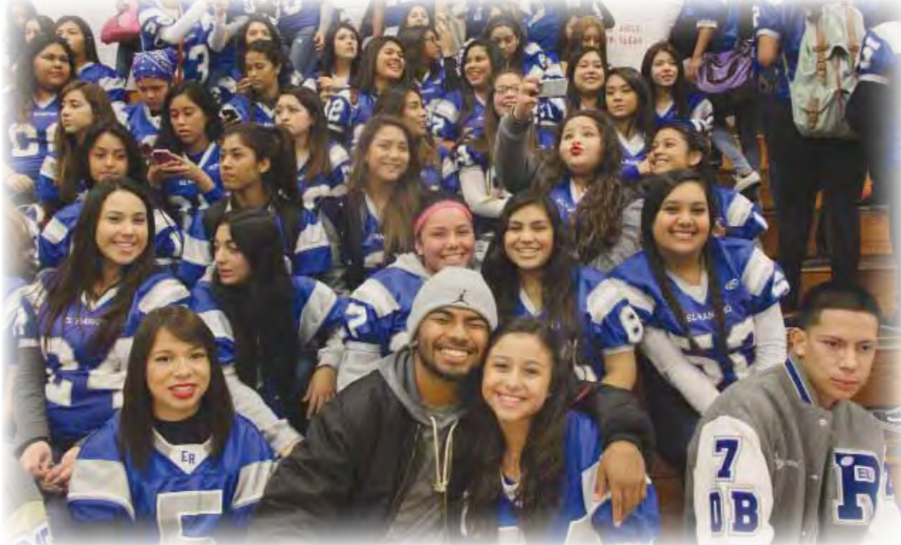
Senior Powderpuff players getting ready for the game during the Pep Rally at lunch.