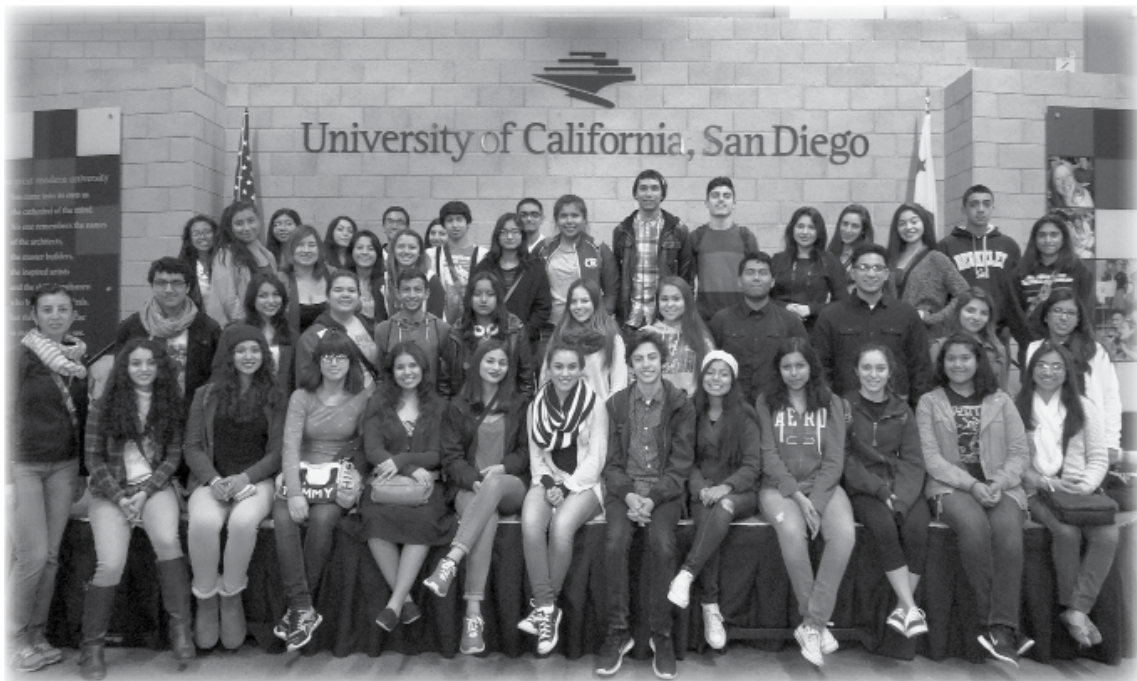
The California Scholarship Federation had the chance to take part in a life-changing opportunity.