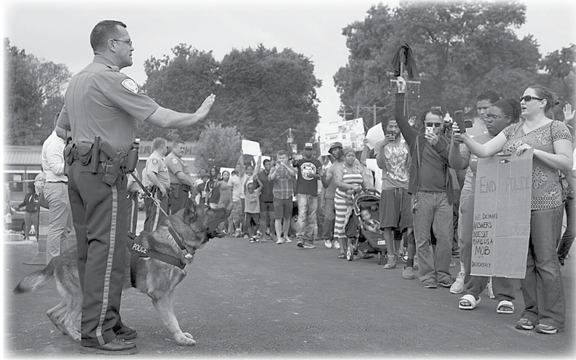
Ferguson police officer attempts to calm down a group of people protesting about recent police brutality.

A whopping 89% of all complaints filed for excessive police force are ignored. What's the point of having a system