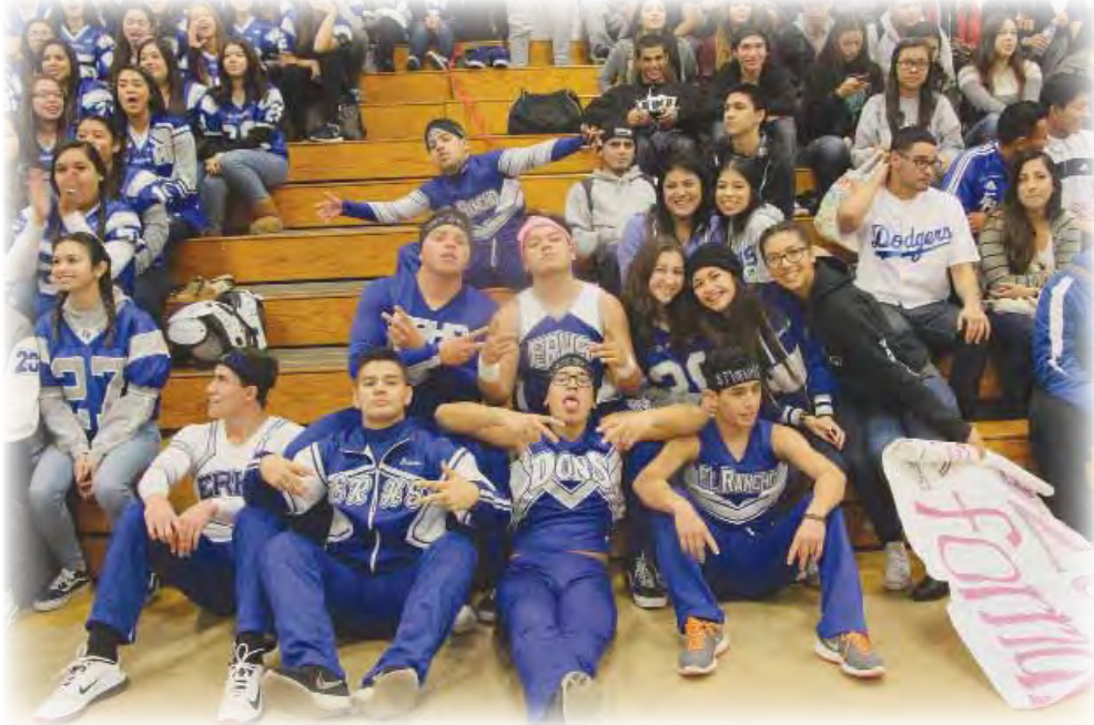
Senior cheerleaders and players during the Powderpuff Pep Rally in the gym at lunch time.