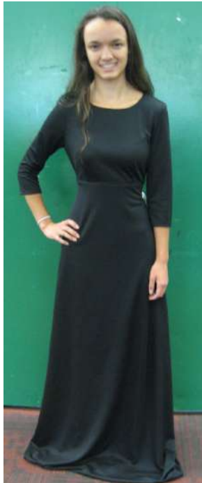
Dress Style: 49N53AA (NEW STYLE NUMBER)