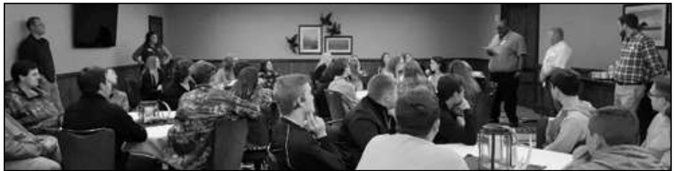
Learning in Action: The WRHS chapter of FBLA listens to a speaker at the Bass Pro Tour.

After the game, everyone headed back to Walnut Ridge and arrived around 12:30 a.m. Although it was a long day, both students and chaperones learned a lot about career opportunities in the Bass Pro Shops locations and the sports industry, but most of all, we had fun!