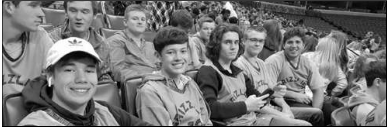
The Boys: Our future business leaders enjoying the Memphis Grizzlies' game in style.