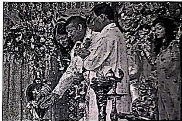
"Durban 037"

It was the beginning of 2009. I was on holiday with my friend in Manipur without informing my parents.