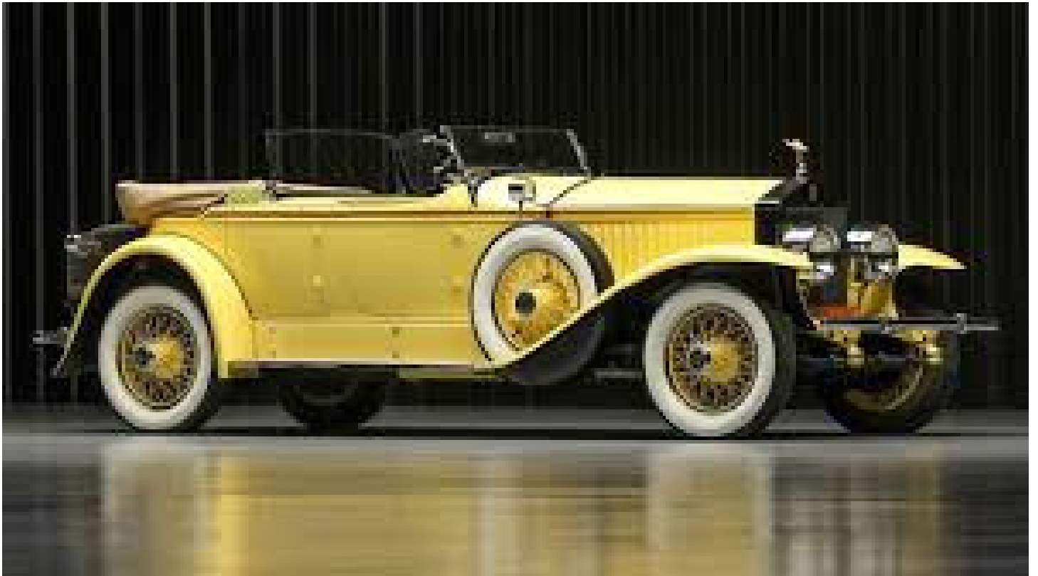
Yellow car Witness #2 sees leaving the scene