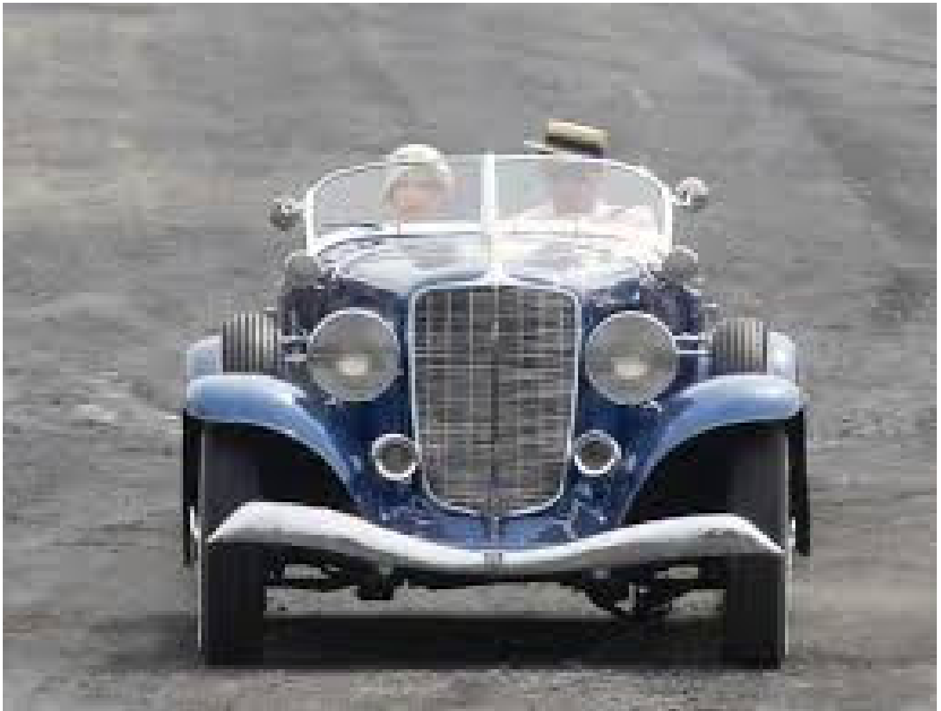
Tom Buchanan's Blue Coupe