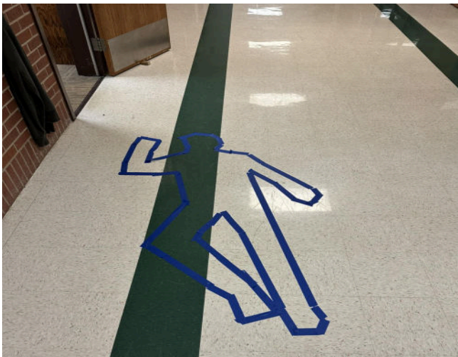
Teaser for day 2

Read to students: Your job is to become a Crime Scene Investigator and figure out who killed Myrtle Wilson. Tape the pictures to a vertical board and use the text to recreate the scene. Draw lines to connect characters. Read the witness testimony carefully; witnesses are notoriously unreliable.