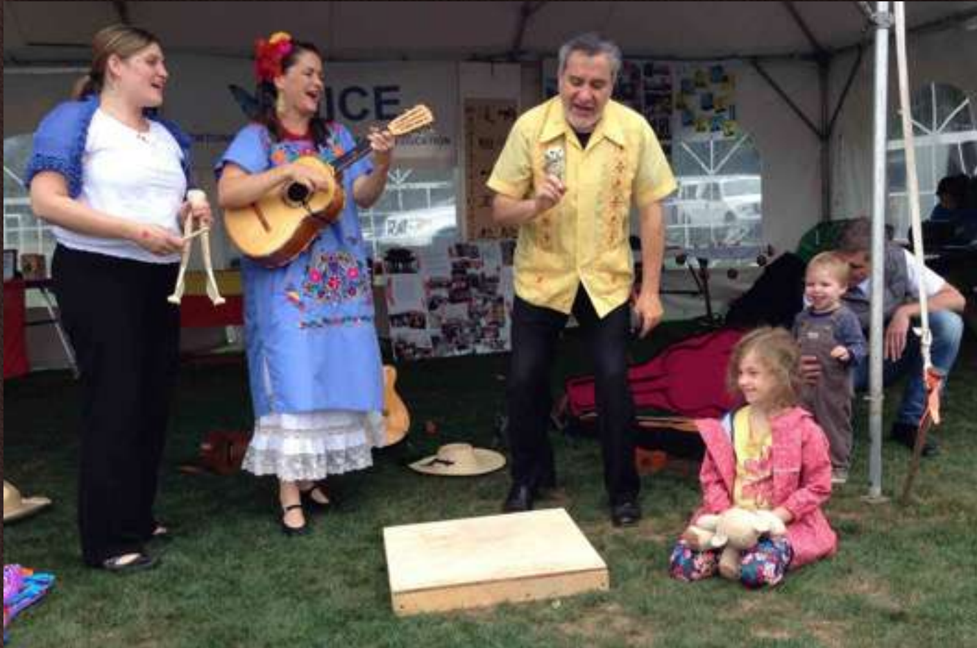
Newtown Cultural Arts Festival, September 2014