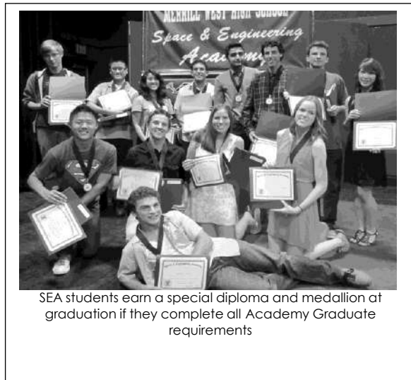
SEA students earn a special diploma and medallion at graduation if they complete all Academy Graduate requirements

Community - SEA students are part of a small learning community. They are with students and teachers who share their interests, giving them a supportive and personalized high school experience. SEA students are also part of West High, so they can participate in all West High sports, clubs, and other activities.