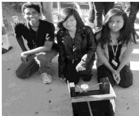
Engineering 1 students design tennis-ball catapults that can hit a target 50 feet away