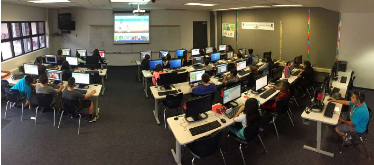
First three photos: Students in Amanda Graf's fifth grade class at Cattle Elementary in Chino work on their second session of coding.