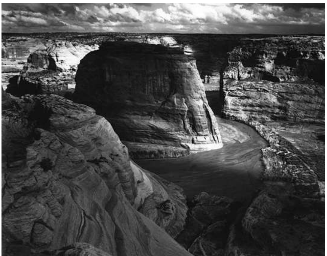
Canyon de Chelly, Ansel Adams (1941)

States, particularly national parks such as Yosemite National Park. Adams made a mark not only on the world of photography, but also on the national park system during his fifty plus year career. His landscape photographs brought individuals to places in the days before the average tourist began to travel to them, and brought to the forefront environmental concerns. His photographs also helped to move photography into consideration as art, comparable to other artistic forms such as music and painting.