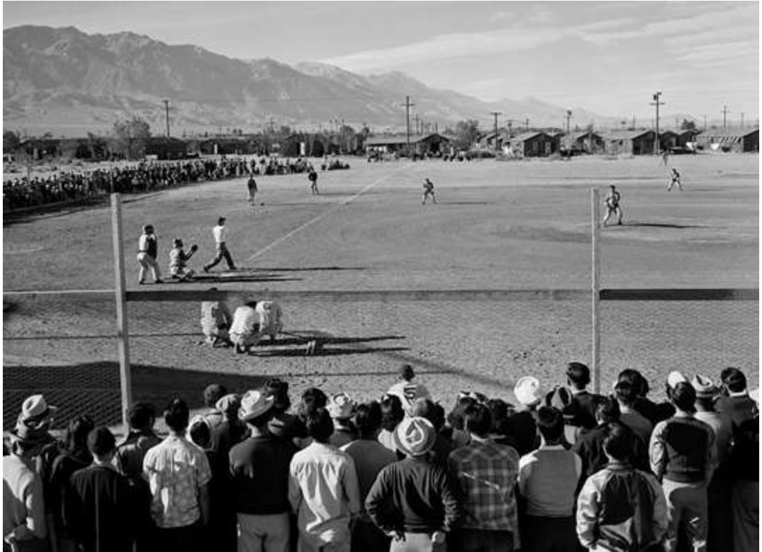
Baseball game at Manzanar War Relocation Center, Owens Valley, California, Ansel Adams (1942)

One of Adams' contributions to the area of photography was in the development of his Zone System. The Zone System was a way of adjusting the exposure in a photo to make the most of the shadows and highlights. Looking at Adams' work, it is clear that the manipulation of light was one of his strengths. The Zone System developed by Adams separated the tones between white and black into eleven different zones, with middle gray at the center. Each of these zones corresponded to an f/stop. The system helped to make sure that a photo was exposed correctly, rather than being under- or overexposed. To use the system, a photographer would choose a particular area of the photo, meter the area, and then adjust the exposure using the system to put the area of the photograph into the exposure that best measures the area. For example, let's say that you are photographing a mountain scene. Bright snow might be metered at a zone V (5), but you want it at a zone IX (9). Using the system, you would know to increase the