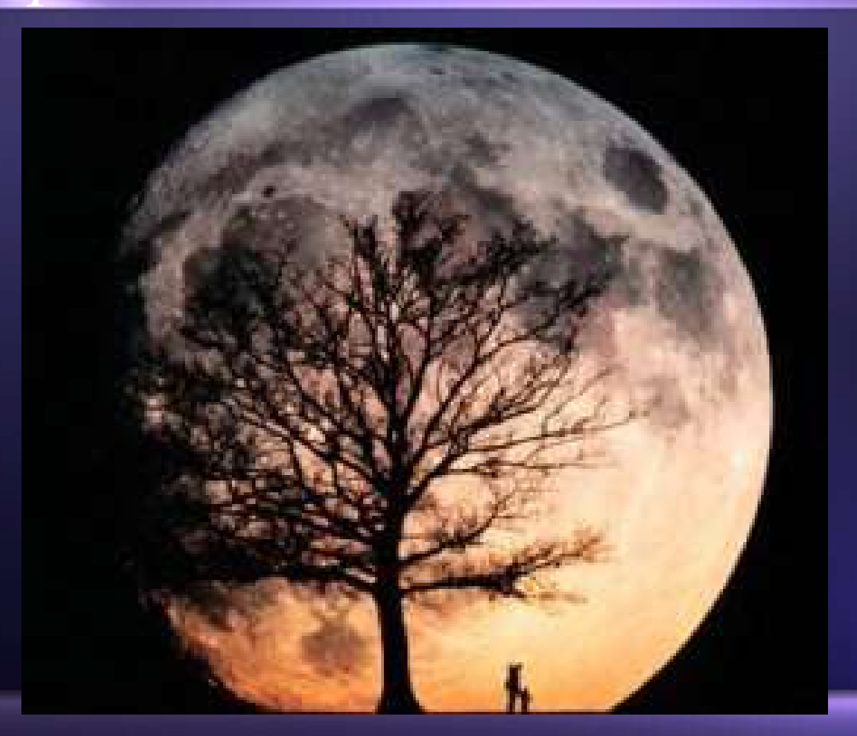
What type of shapes do you see?