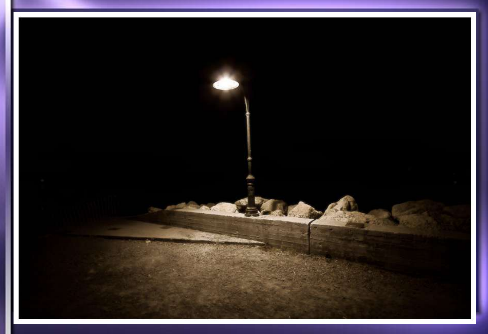
What type of light & darks do you see?