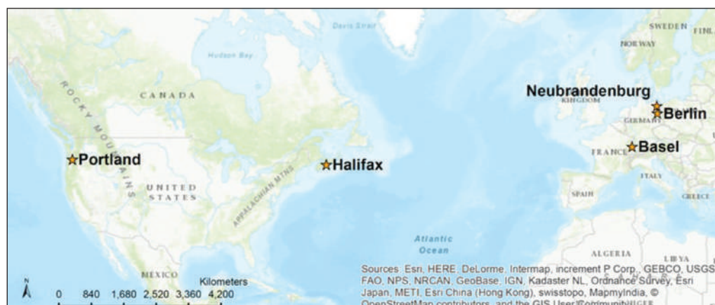
Figure 1. Map showing location of our study sites.

We assembled data on beetle species diversity and abundance from 2 cities in North America (Halifax, NS, Canada; Portland, OR, USA) and 3 cities in Europe (Basel, Switzerland; Neubrandenburg, Germany; and Berlin, Germany; Fig. 1). A summary of the different studies compared in the present paper are provided in Table 1. In all 5 cities, beetles were collected using pitfall traps. We categorized roofs as intensive if they were over 20 cm in depth, extensive if they were under 20 cm in depth, and as extensive–varied if they were purposely designed with varied substrate-depth but where depth was \leq 20 cm in all areas. Data from Portland (PDX) are from a 2014 (March–September) survey that included 8 roofs: 1 intensive, 2 extensive–varied, and 5 extensive roofs. Data from Halifax (HAL) came from a 2009 (May–October) study of 5 intensive roofs (MacIvor and Lundholm 2011). Our species lists from Berlin (BER), and Neubrandenburg (NEU), Germany are described in a separate article in this special issue (Ksiazek-Mikenas et al. 2018). Beetles were collected over 1 field season (April–September) in 2013 at 8 roofs in BER and 5 roofs in NEU; these roofs were all classified as extensive. Data from Basel (BSL) came from a 2013 (March–September) collection from 15 roofs: 6 extensive–varied and 9 extensive.